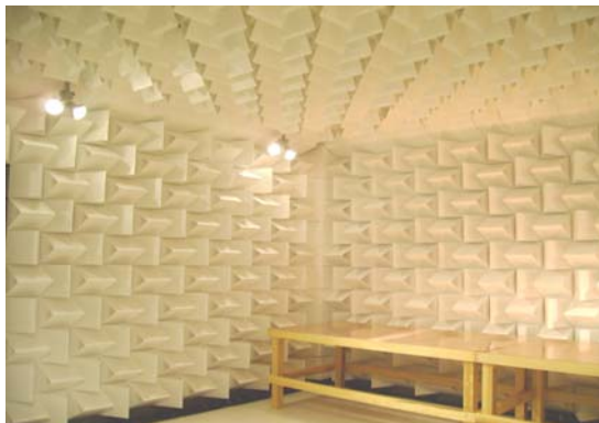
MIL 461E Test Chamber