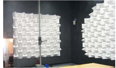
Hybrid on Ferrite Absorber in FCC Filed 3 Meter EMC Chamber