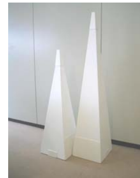
60 cm and 90 cm Pyramidal Hybrid