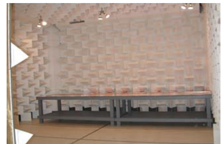
Hybrid on Ferrite Absorber in a Multi-Purpose EMC CISPR25 / MIL461 / Avionics Test Chamber