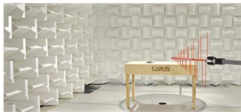
3 Meter Compact EMC Chamber